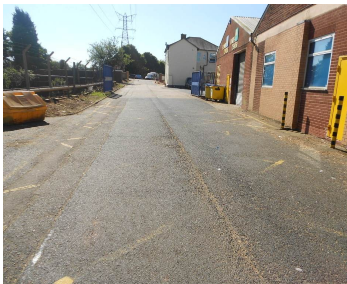
Main Entrance Driveway