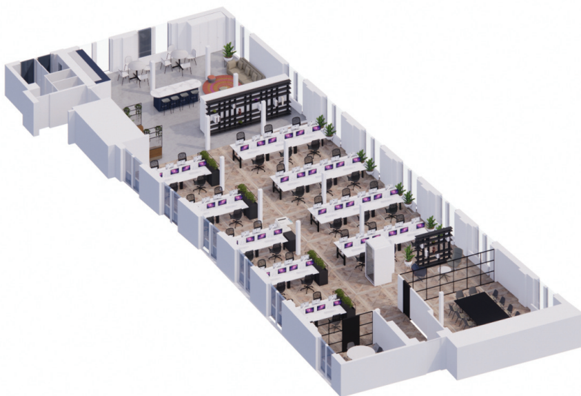
AXO IMAGE OF SUGGESTED OFFICE LAYOUT

BUILDING SIZE: 73,575 sqft BUILDING FLOORS : 5 UNIT: 4th floor South