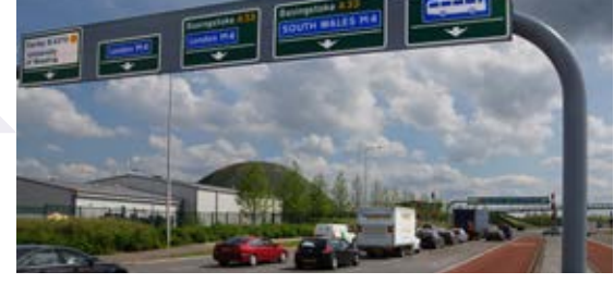
to London, Basingstoke and The West