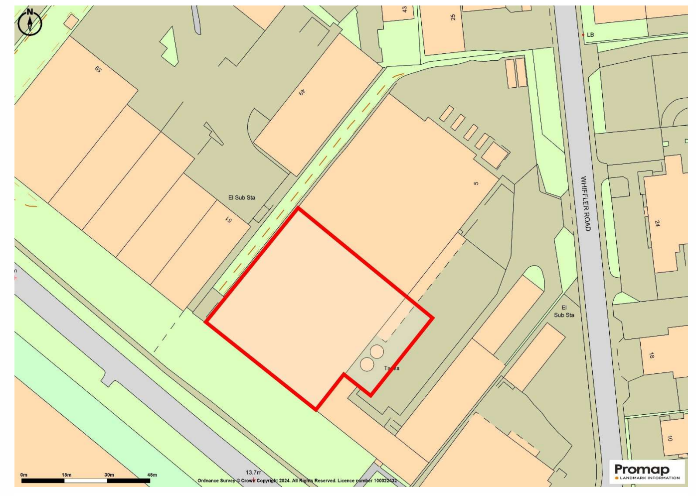
N.B. Tanks and canopy now removed