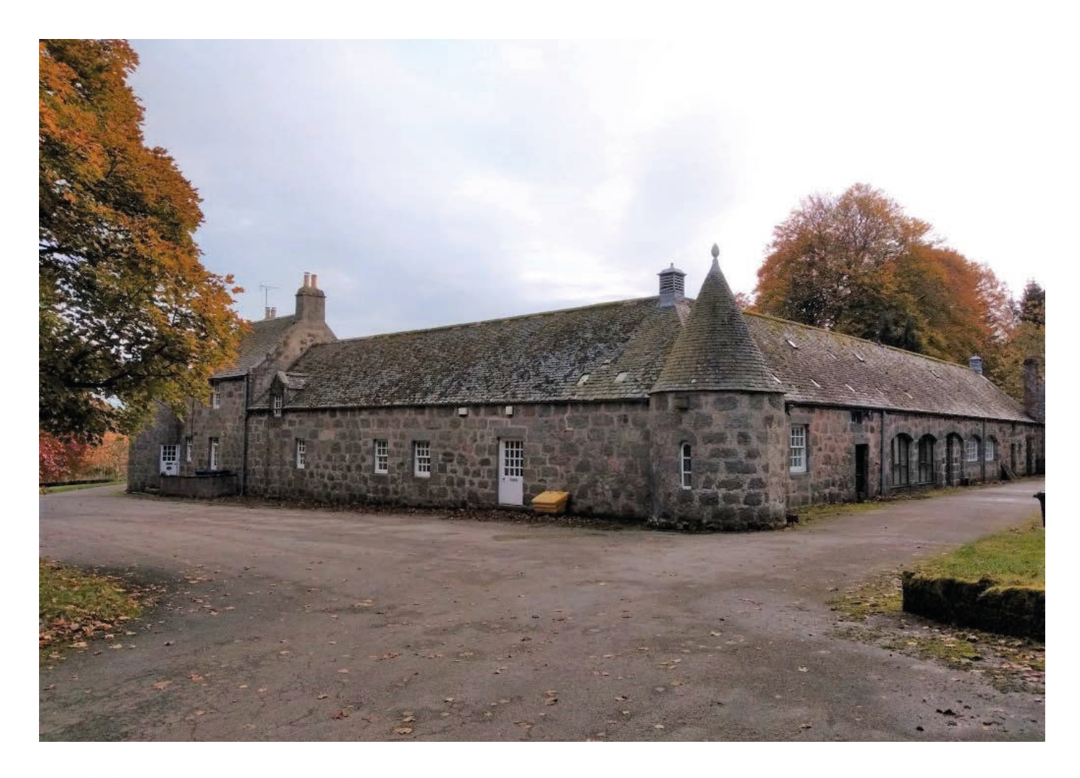
Stable Offices, Castle Fraser, Sauchen, Inverurie, AB51 7LD