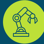
Specialist component/ clean room manufacturing