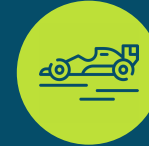
Motorsport/ motorsport development