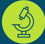
Research and development