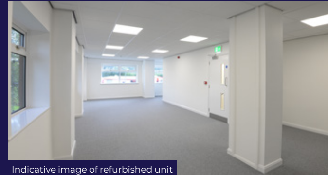
Indicative image of refurbished unit