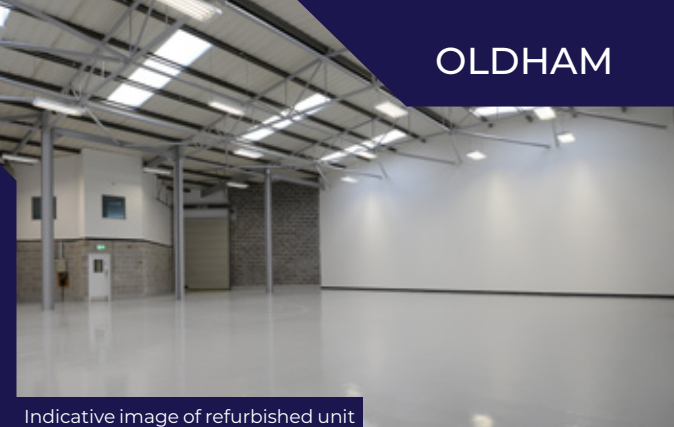
Indicative image of refurbished unit