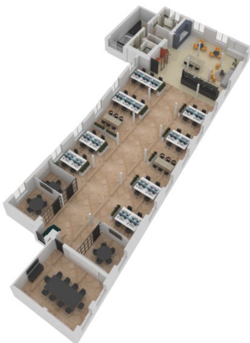
AXO IMAGE OF SUGGESTED OFFICE LAYOUT

UNIT SIZE: 4,013 sqft BUILDING SIZE: 73,575 sqft DESKS: 40-80 BUILDING FLOORS : 5 RENT: From £19,062 pcm UNIT: 3rd floor South