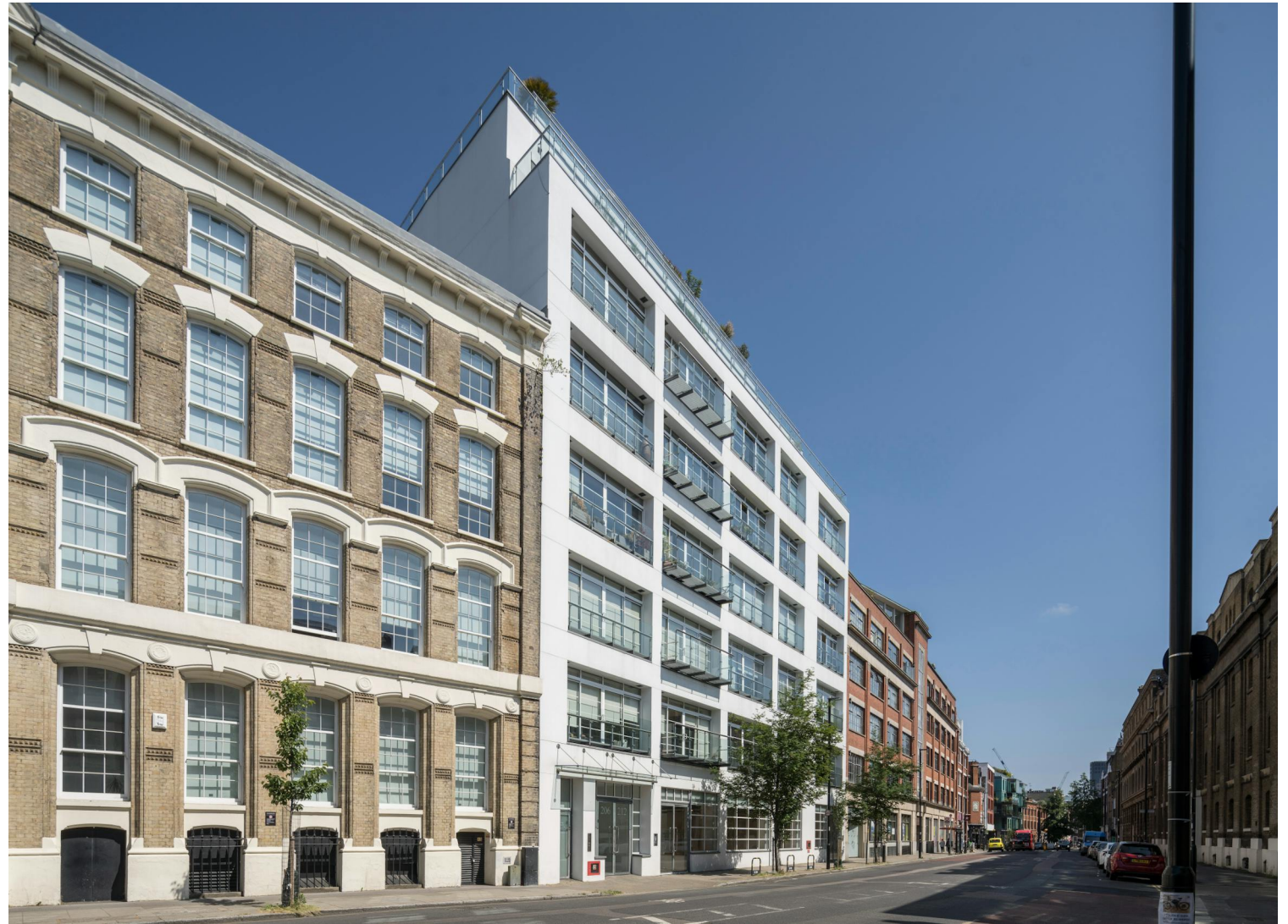
St John Street External