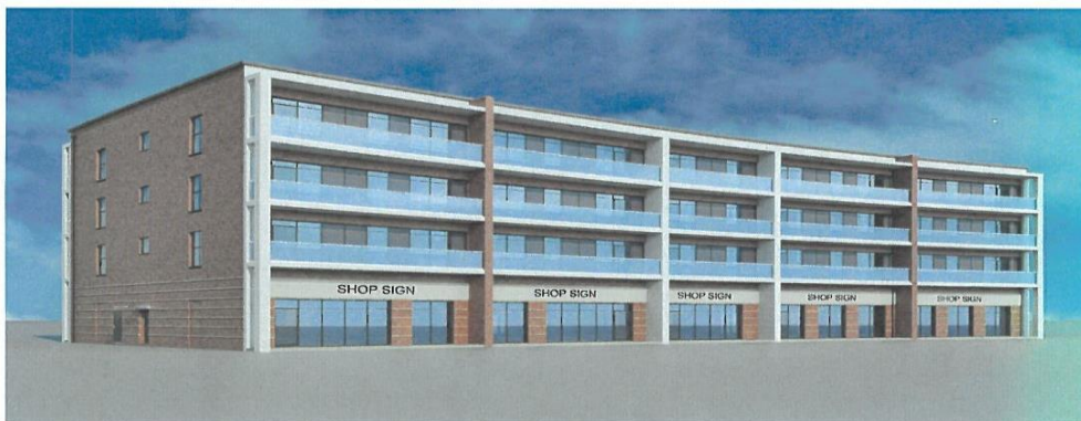
Perspective View Front