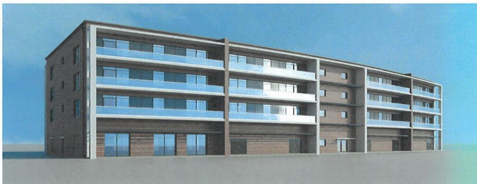
Perspective View Rear

Bartholomew House, 38 London Road, Newbury, Berkshire RG14 1JX