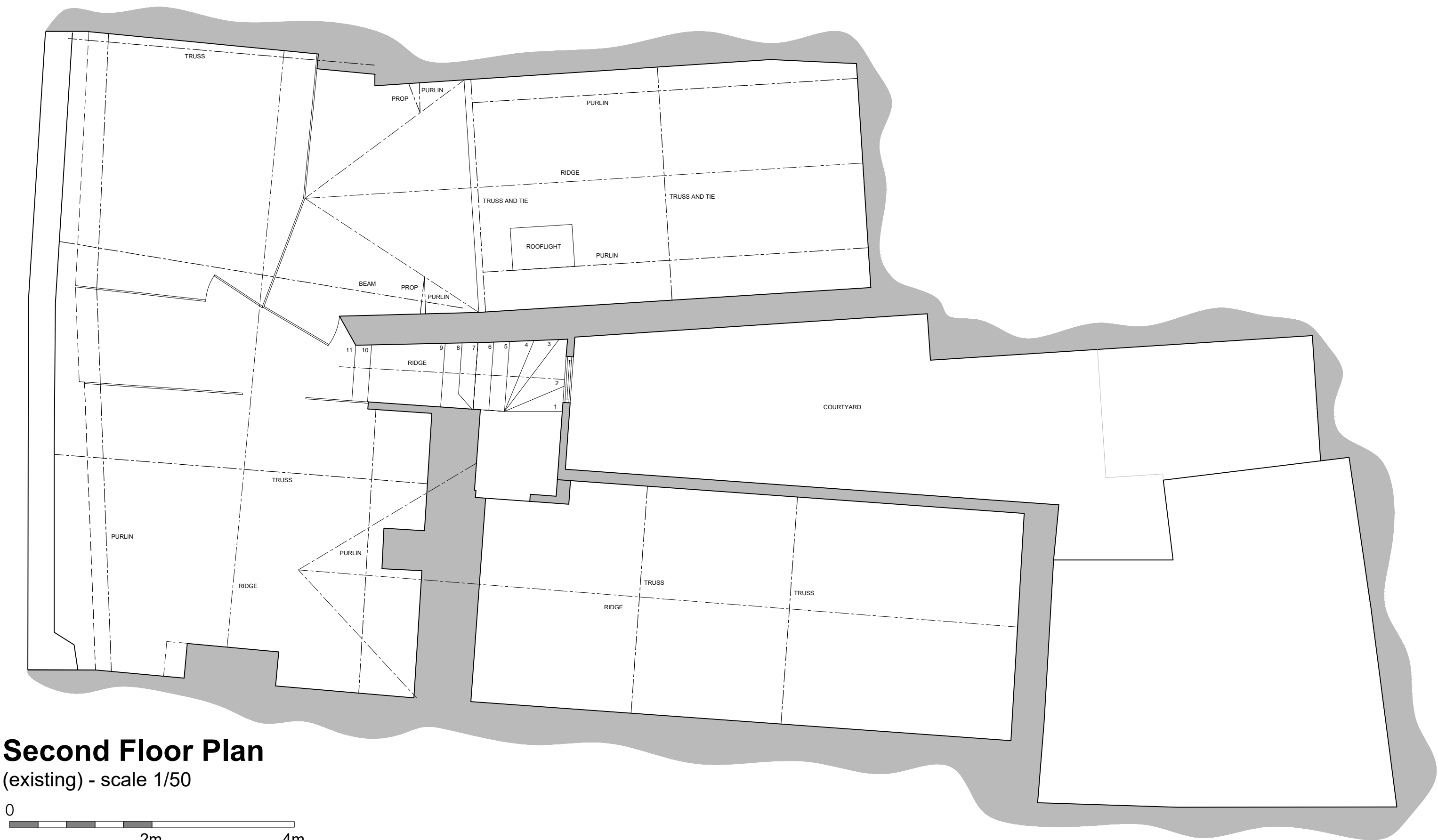
Second Floor Plan (existing) - scale 1/50