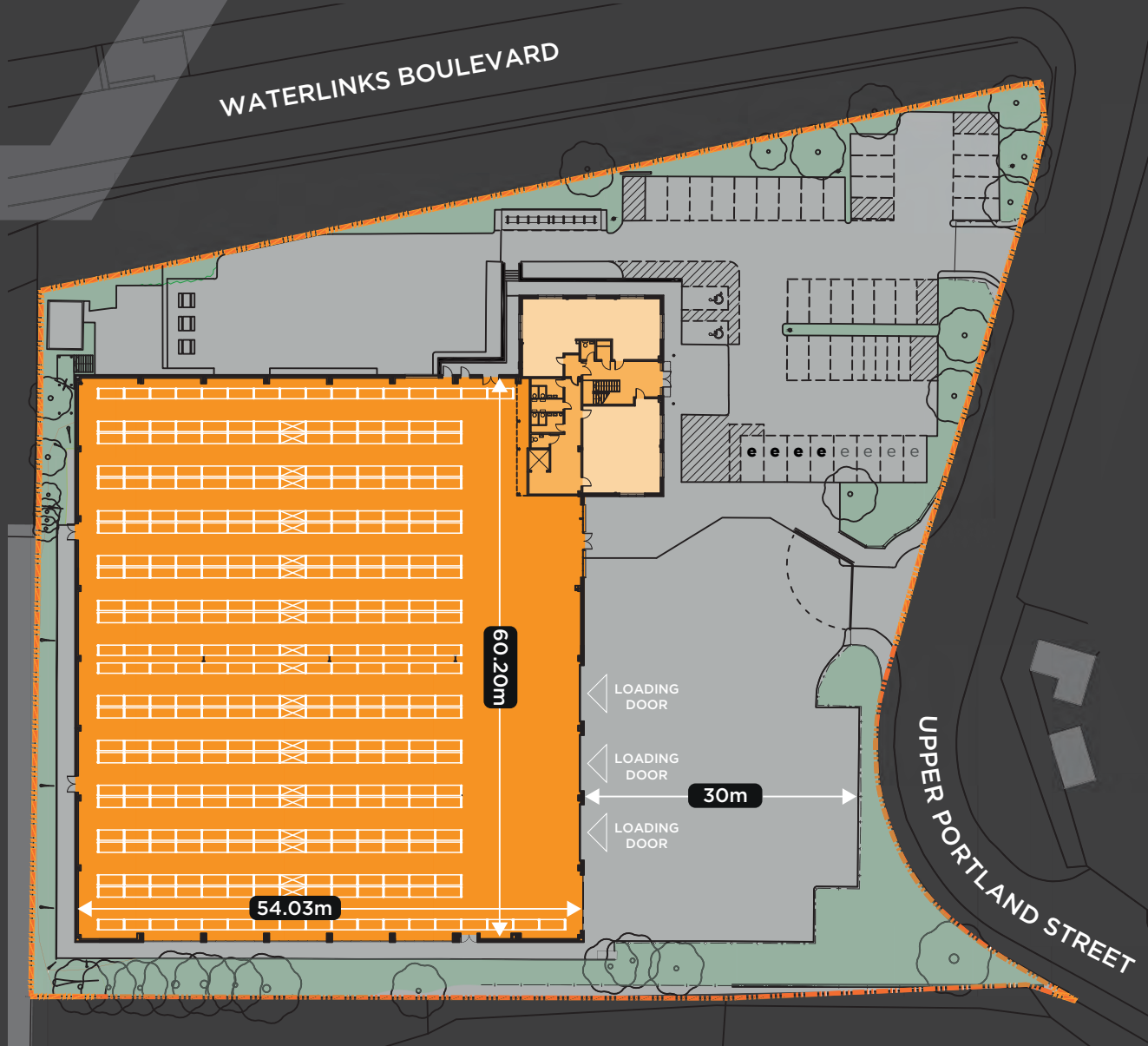
SITE / INDICATIVE RACKING PLAN

A full plan is available to download here: primepoint-birmingham.co.uk/contact