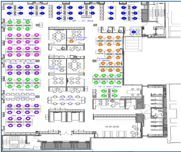
Indicative plan – not to scale