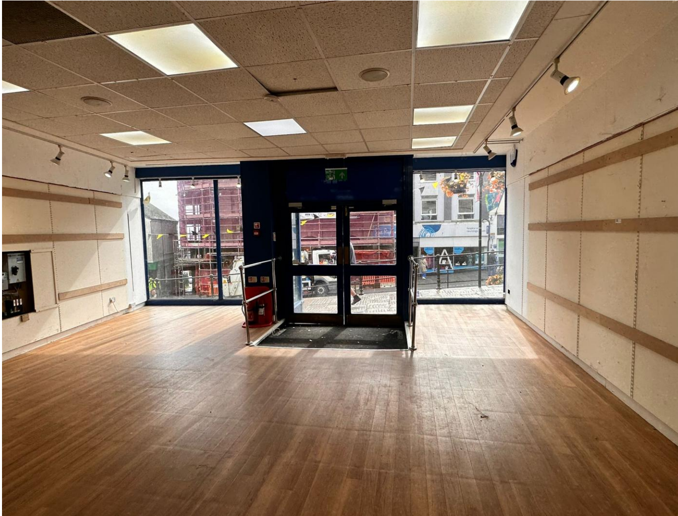
Ground Floor Shop