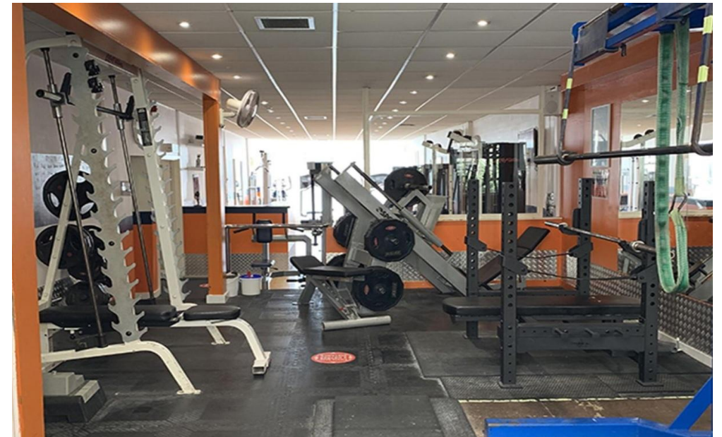
First & Second Floor GYM