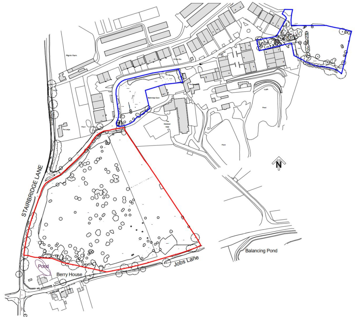
1 Location Plan 1 : 2500

Each party is to be responsible for their own legal fees.