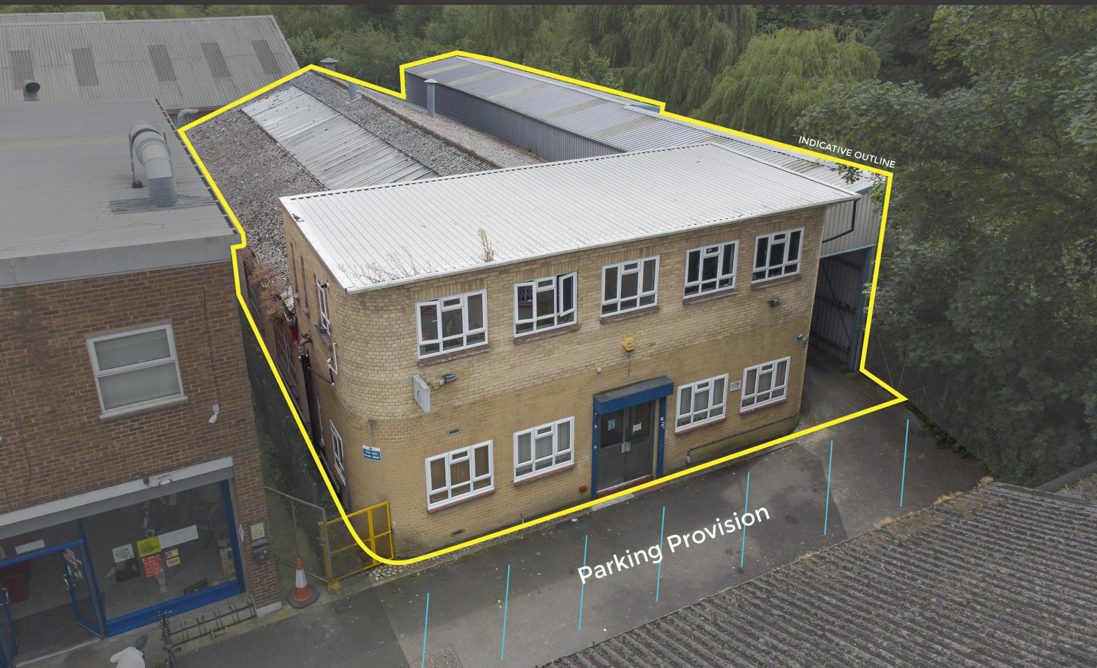
Unit 6 Eskdale Road Uxbridge, UB8 2RT