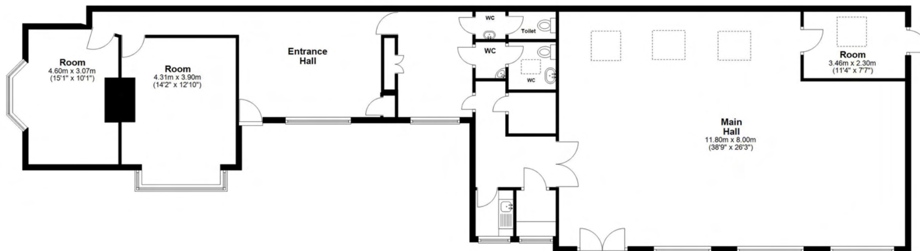
First Floor Approx. 87.6 sq. metres (942.7 sq. feet)