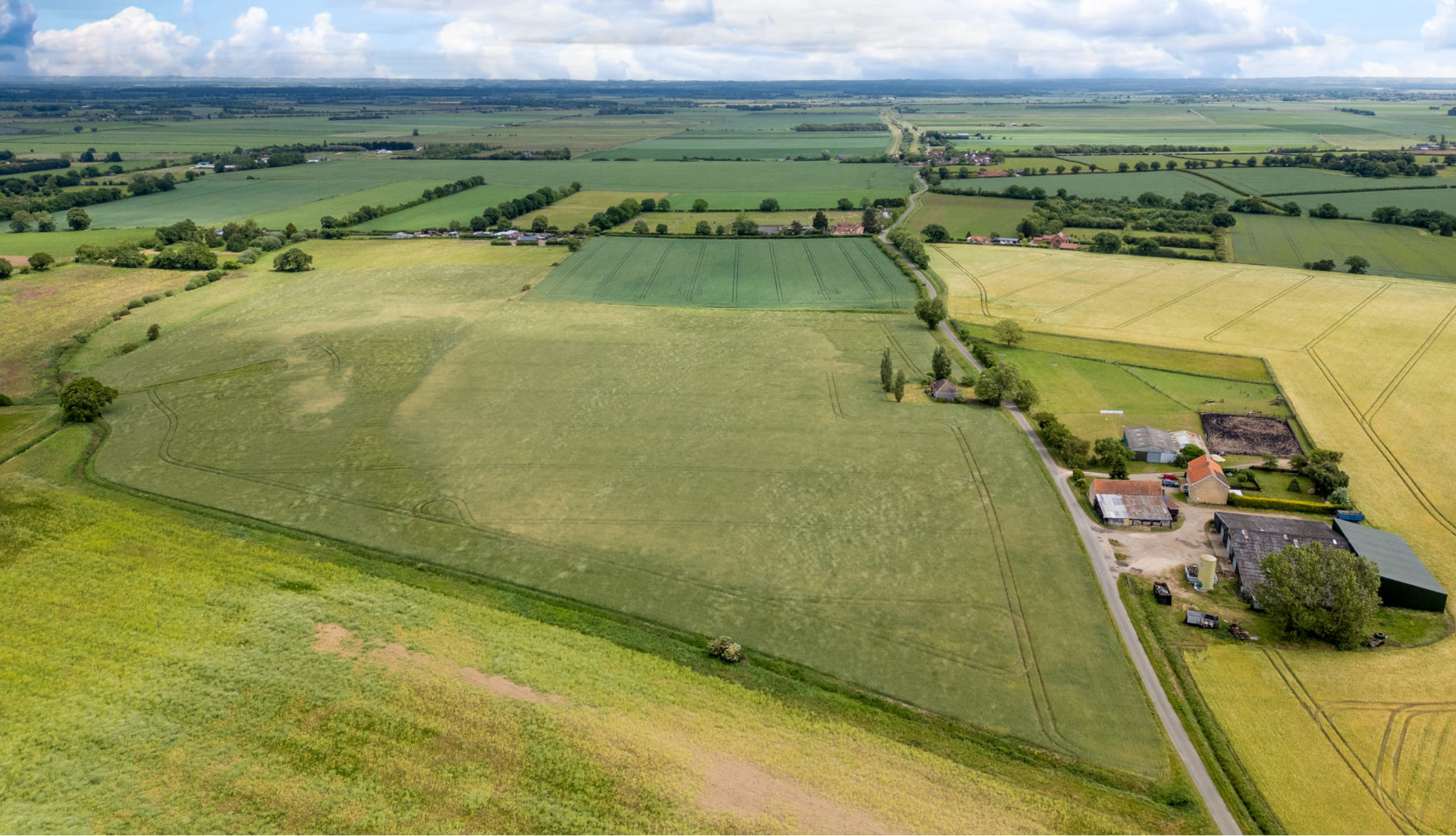
Land at Stone House Farm Branston Booths, Lincoln