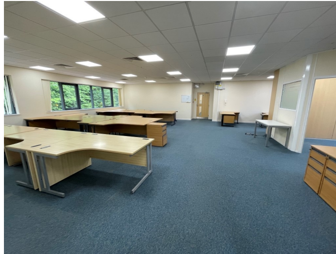
Main Office Area

Amberside is situated towards the centre of town, in Wood Lane, off the main A414 St Albans road leading from the town centre to the industrial estate and M1, and is visible from this road. All town centre amenities are within a short walk