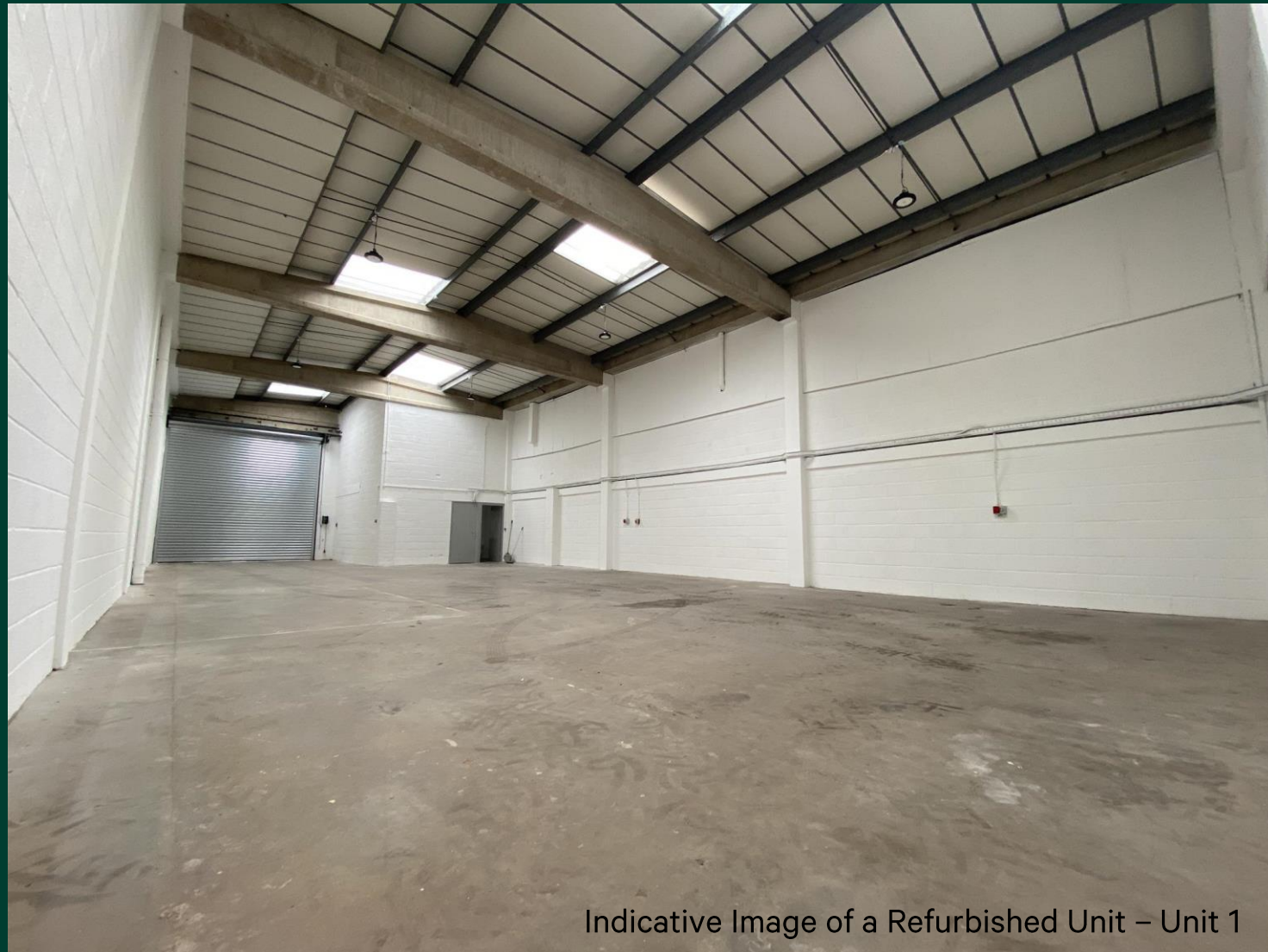
Indicative Image of a Refurbished Unit – Unit 1