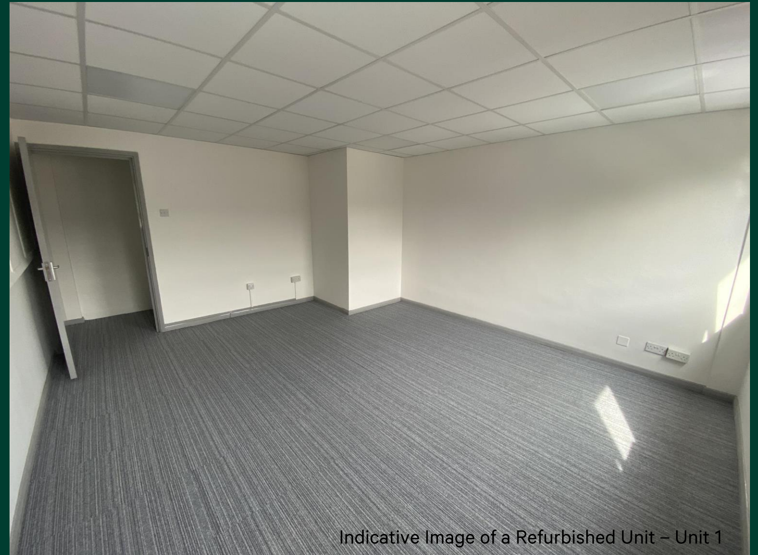
Indicative Image of a Refurbished Unit – Unit 1